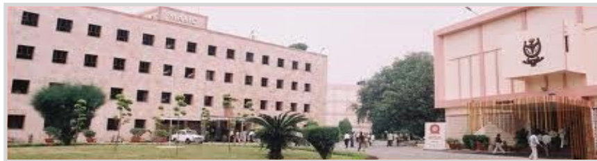
Maulana Azad Medical College, New Delhi