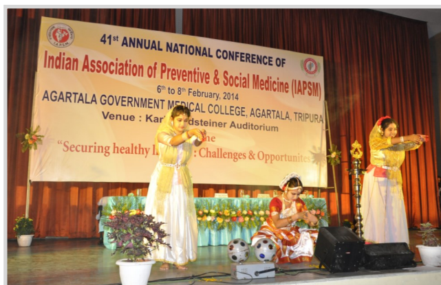
41 st Annual National Conference IAPSMCON, Indian Association of Preventive and Social Medicine. Tripura, India.

The conference, which is held annually, had the theme: "Securing healthy lifestyle: Challenges & Opportunities".