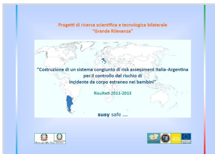
Cover of the promotional book on the 2011-2013 collaboration

Furthermore, Susy Safe Members wish the new project will once again have the privilege of receiving the support of the Argentine Ministry of Health and Ministry of Science and Technology (Mincyt).